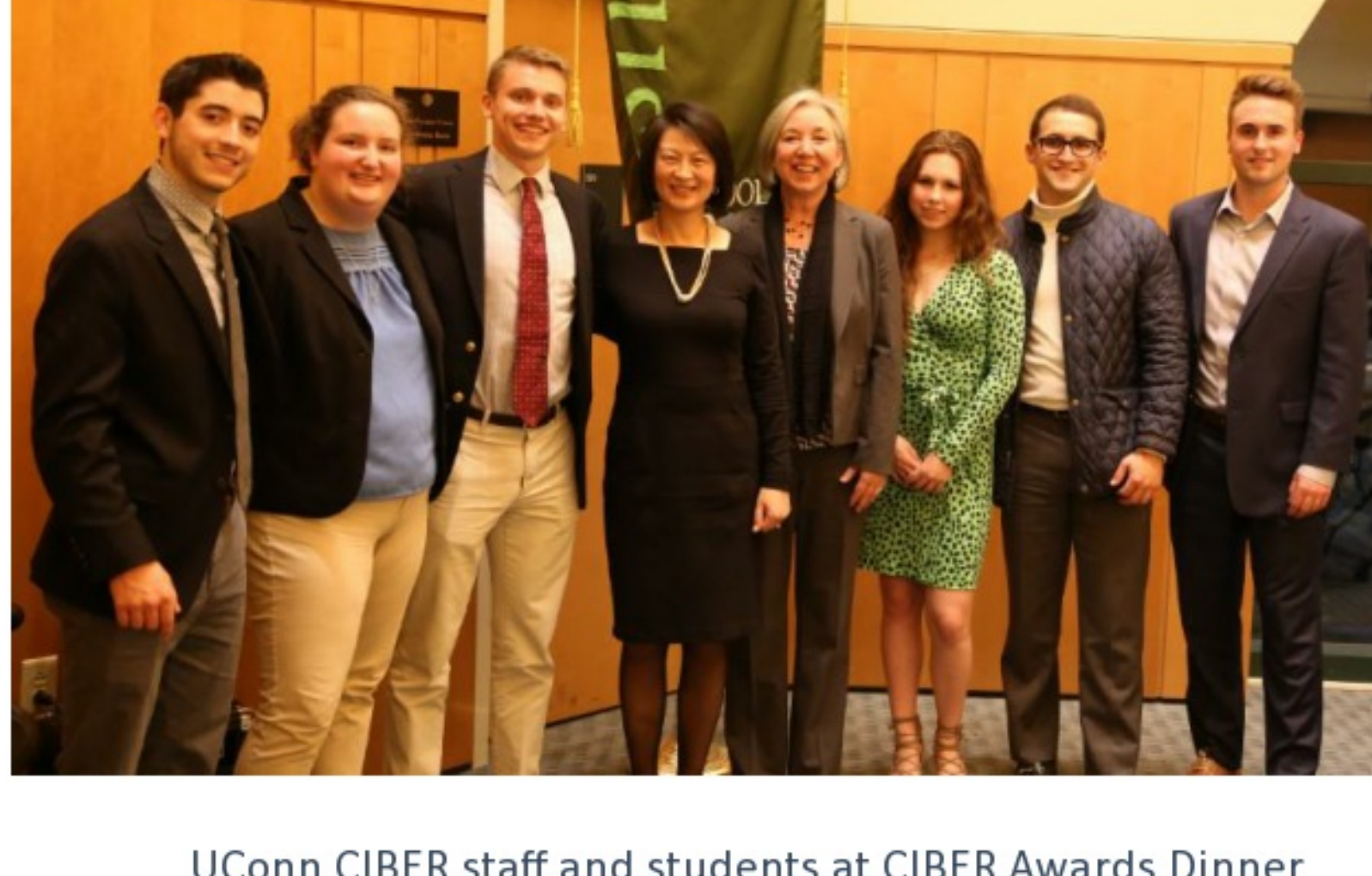
UConn CIBER staff and students at CIBER Awards Dinner